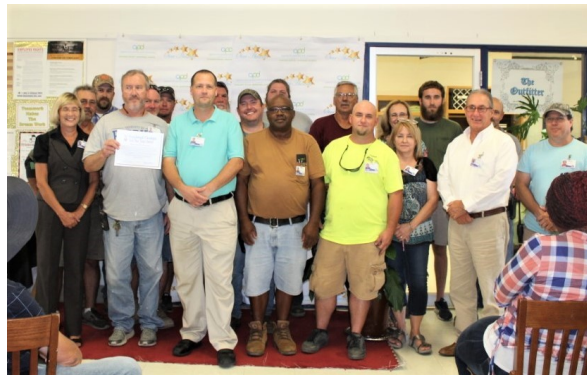
GOLD STAR TEAM AWARD MAINTENANCE / OPERATIONS DEPARTMENT