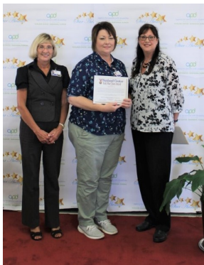
GOLD STAR TEAM AWARD FOOD SERVICE DEPARTMENT

A host of character qualities were recognized in September to include: Attentiveness, Availability, Benevolence, Cautiousness, Creativity, Dependability, Determination, Diligence, Endurance, Enthusiasm, Flexibility, Initiative, Joyfulness, Orderliness, Responsibility and Resourcefulness!