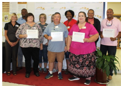
GOLD STAR TEAM AWARD THIEL CENTER DIRECT CARE, BEHAVIOR SERVICES, CSS RECREATION, RANCH & RECYCLING